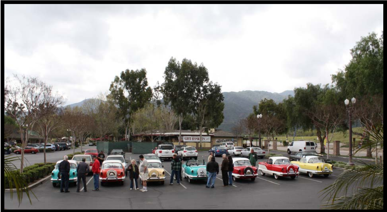
A scene from the porch of the Mexican restaurant where we had lunch. Our Mets garnered their fair share of affection throughout our stay.