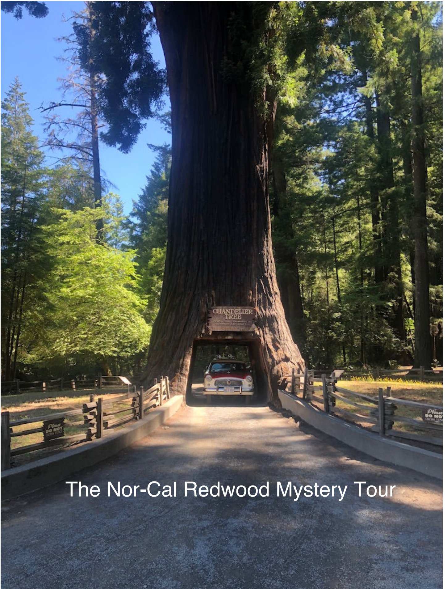
The Nor-Cal Redwood Mystery Tour