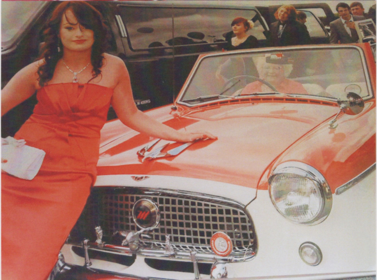
(SJ - can there ever be a better way to turn up at your school prom?)