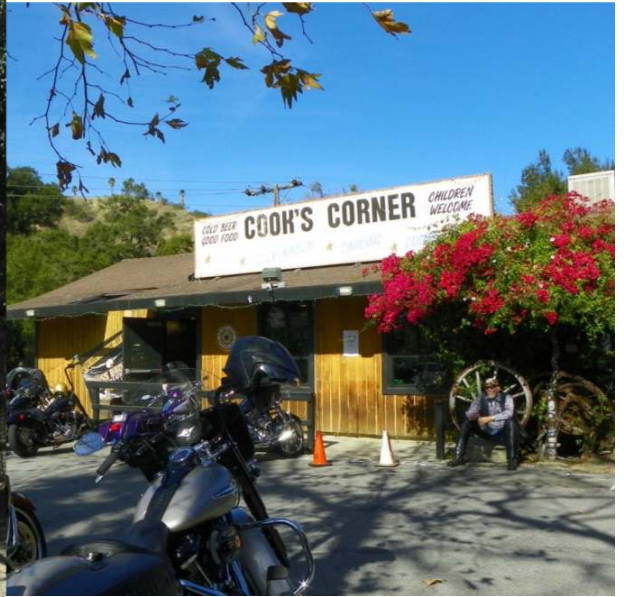
See: https://www.youtube.com/watch?v=EivBfRzT338 for a You Tube video of a canyon run.