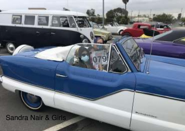
Sandra Nair & Girls