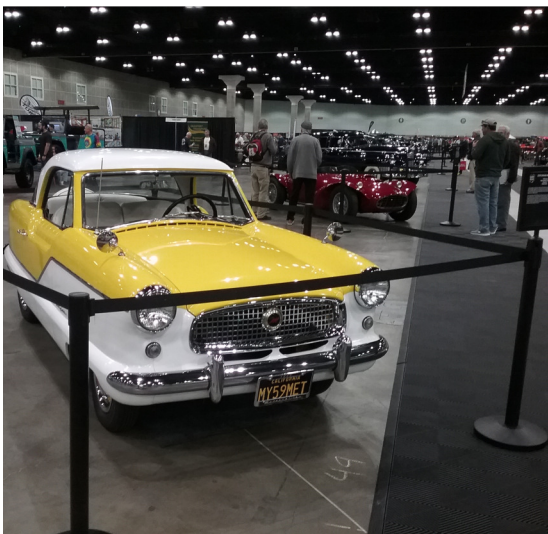
Check out video of show by VW's Mag: https://www.facebook.com/HotVWs/videos/1846394312061785/