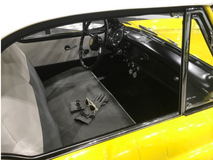
Note Cindy's houndstooth driving gloves & matching white frame shades.