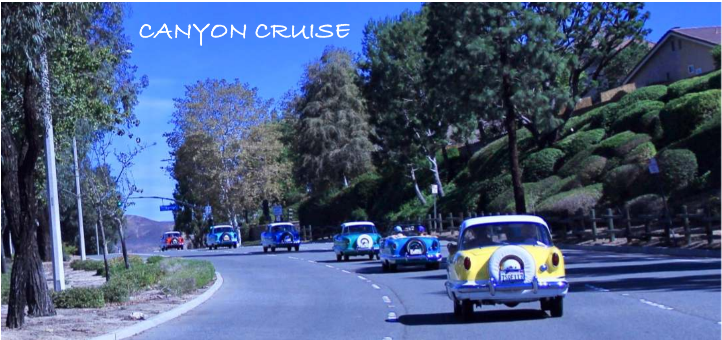
Our October adventure was a tour of the old Santa Ana Canyon from East Anaheim to Gypsum Canyon. There we crossed the Santa Ana River & turned back west to Yorba Linda where we lunched at Polly's Pie's.