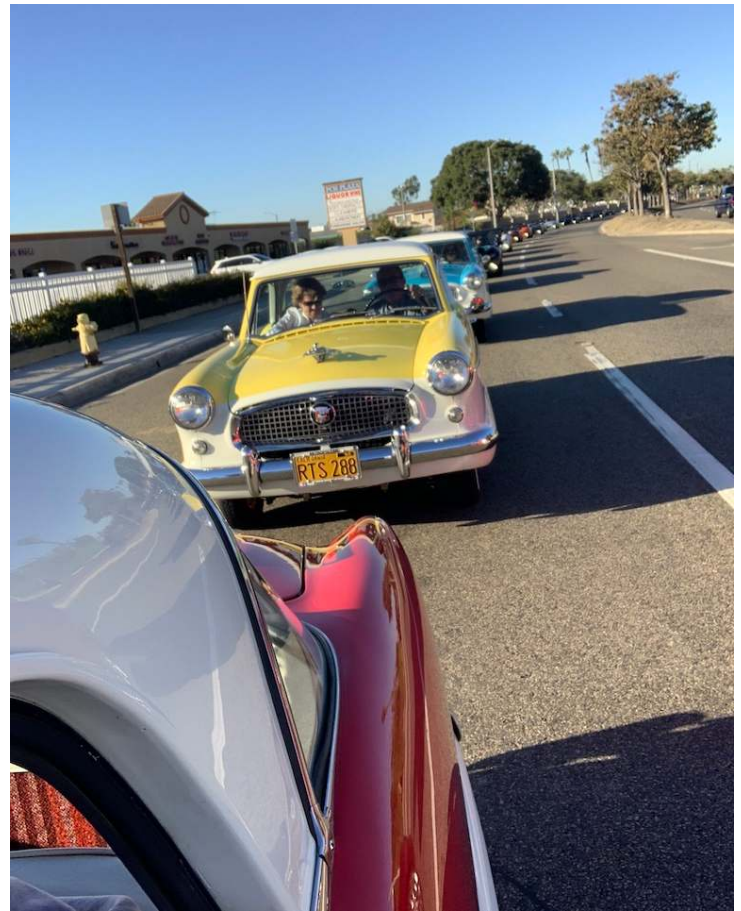
After lunch everyone headed home. Some of us while on PCH witnessed a large Mazda Miata club come from behind and then pass us.