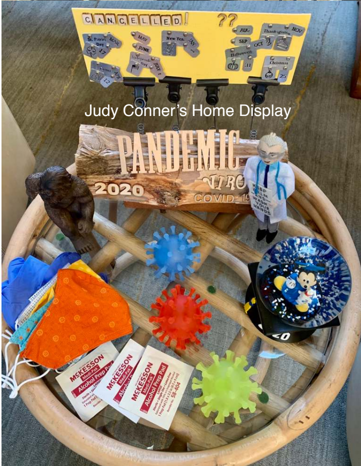
Judy Conner's Home Display