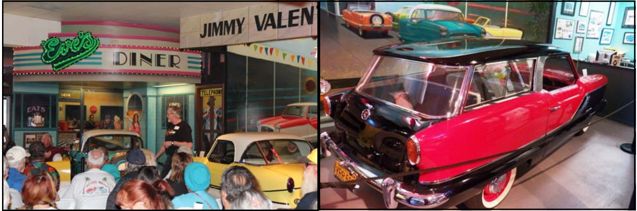
This station wagon was one of two prototypes that American Motors made. Jimmy Valentine sought it out and purchased it in 1980. After a long restoration it is now on display. The other one was destroyed.