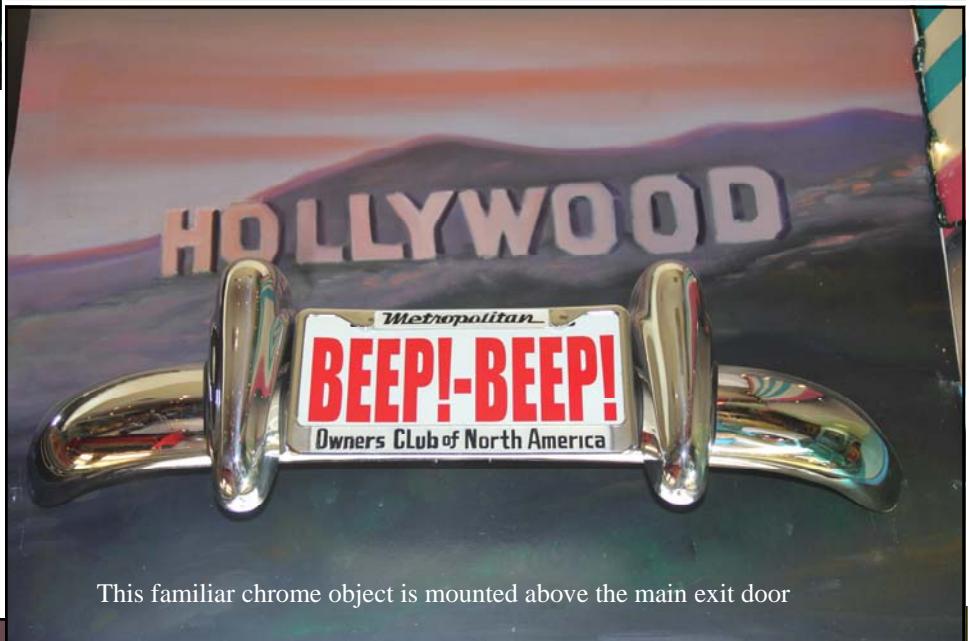
This familiar chrome object is mounted above the main exit door