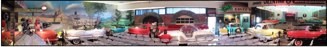
This photographic compilation of the interior museum of the Metropolitan Pit Stop was created by Brian Cotariu.