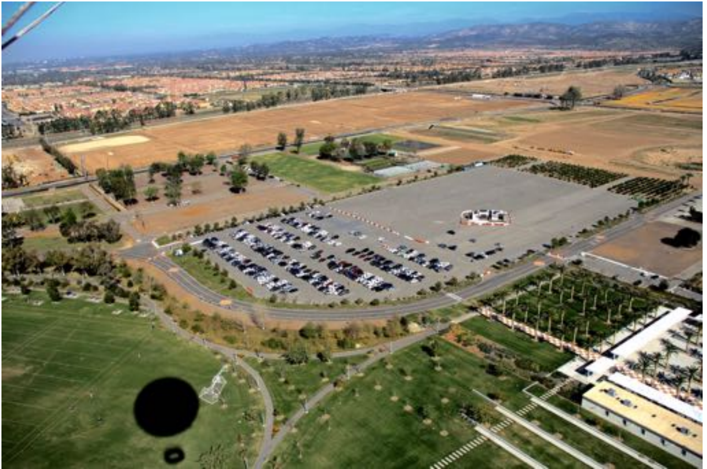
Looking Northwest over Orange County's former El Toro Marine Air Base. Altitude: 400 ft. Notice the balloon's shadow lower left. There are 7 Metropolitans down there in the parking lot somewhere.