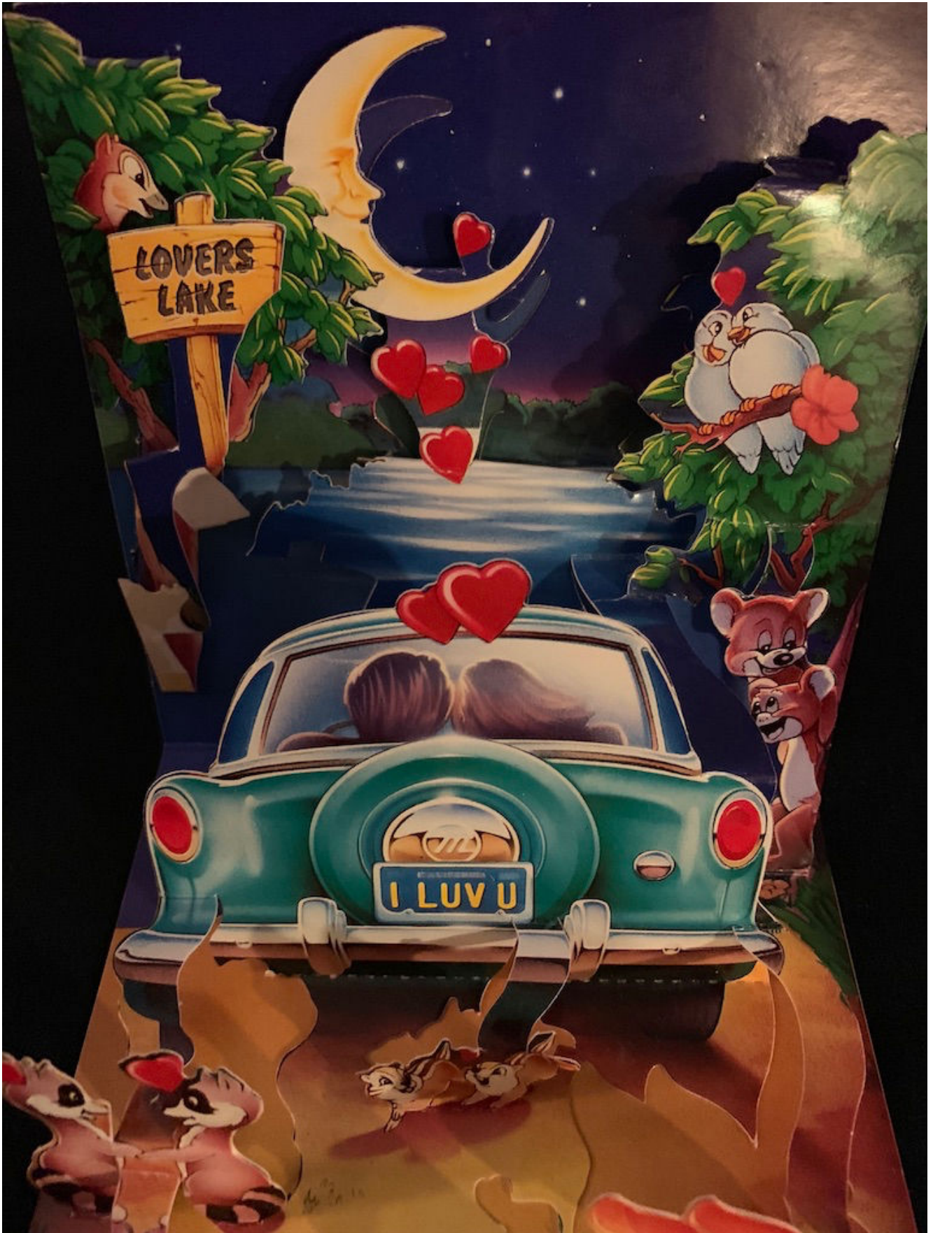
Amongst our plethora of Metropolitan memorabilia we found this old pop up card just in time for February 14th.