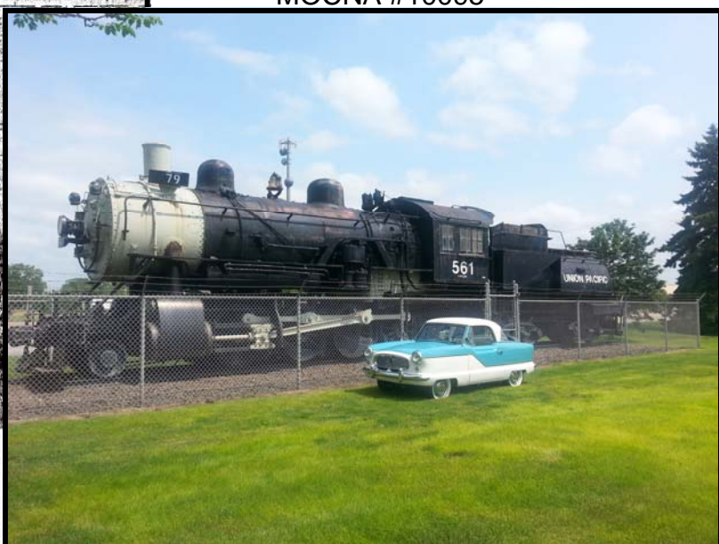
UNION PACIFIC 561