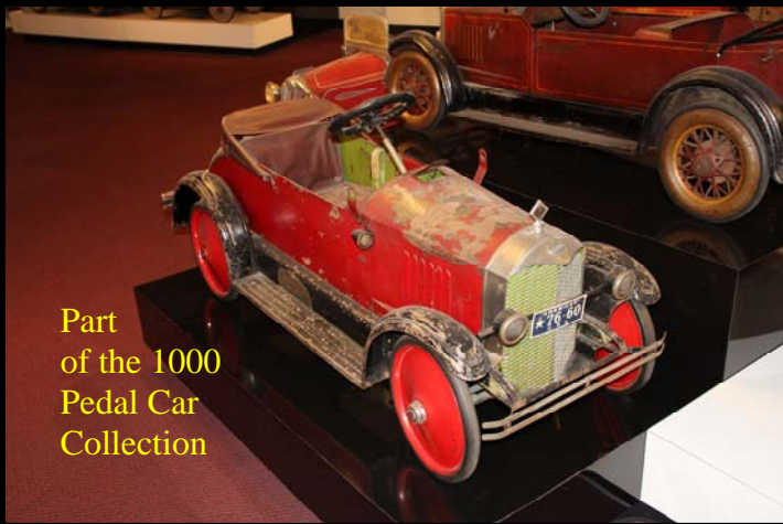
Part of the 1000 Pedal Car Collection