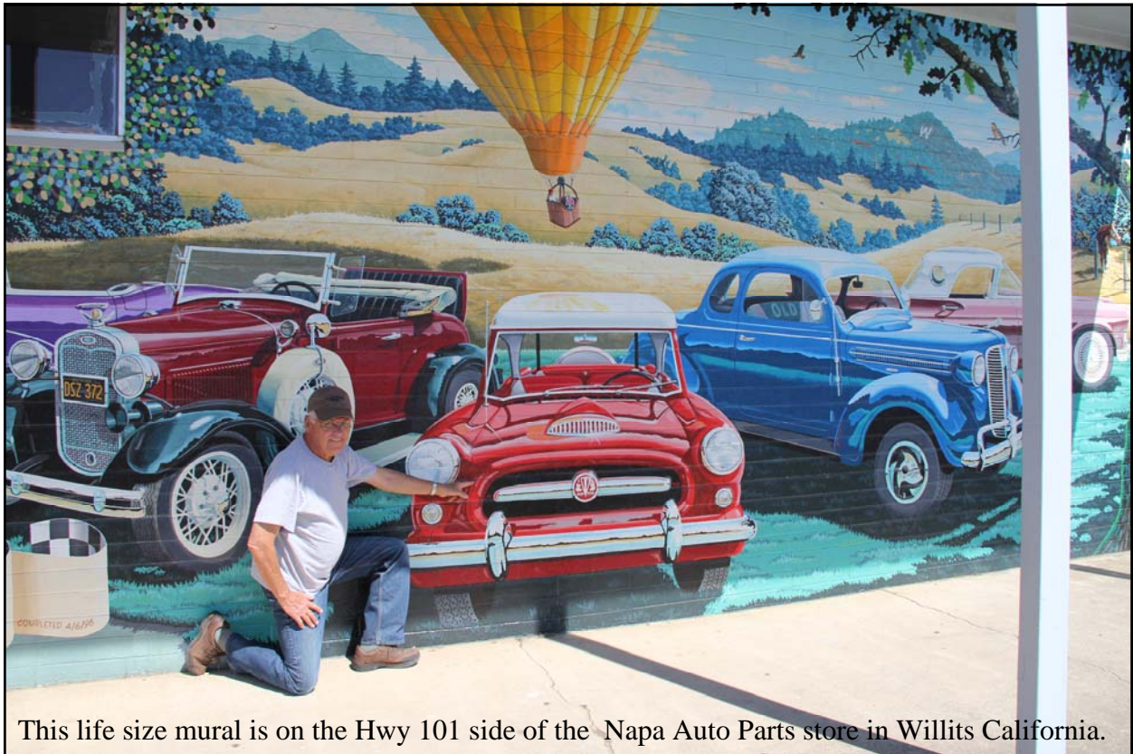
This life size mural is on the Hwy 101 side of the Napa Auto Parts store in Willits California.

Did you know that a cartoon Met appeared in a Warner Brothers Sylvester & Tweety production? View it at: https://www.youtube.com/watch?v=73uWfIxh-0s