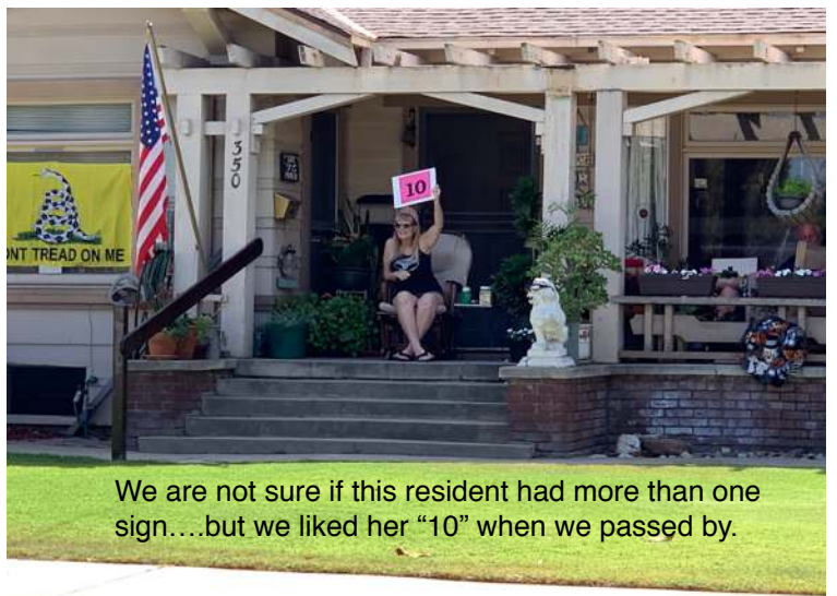
We are not sure if this resident had more than one sign....but we liked her "10" when we passed by.