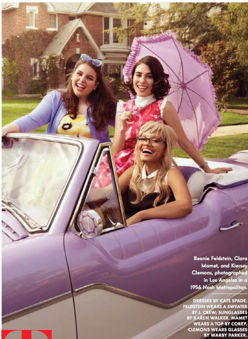
Beanie Feldstein, Clara Mamet, and Kiersey Clemons, photographed in Los Angeles in a 1956 Nash Metropolitan.

DRESSES BY KATE SPADE. FELDSTEIN WEARS A SWEATER BY J. CREW; SUNGLASSES BY KAREN WALKER. MAMET WEARS A TOP BY COREY. CLEMONS WEARS GLASSES BY WARBY PARKER.