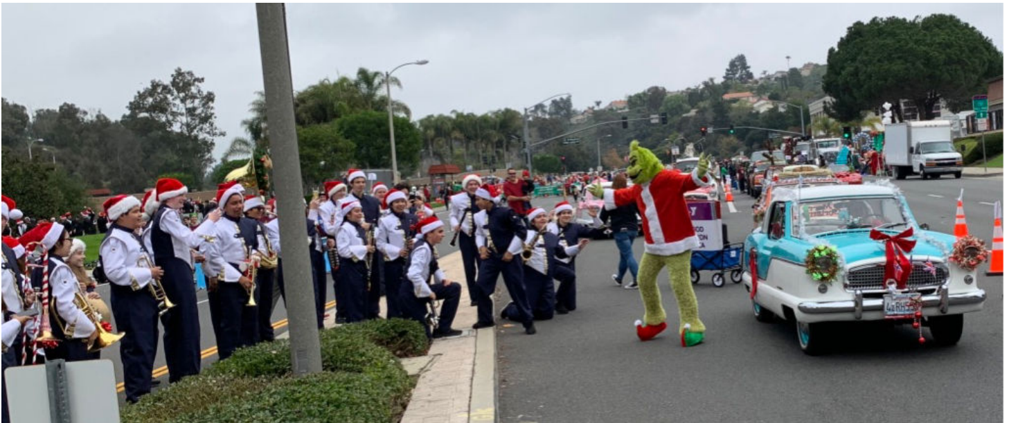
A light hearted moment when band members ham it up with Grinch Paul Van Wig.