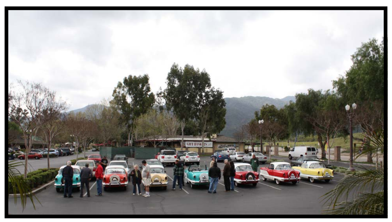
A scene from the porch of the Mexican restaurant where we had lunch. Our Mets garnered their fair share of affection throughout our stay.