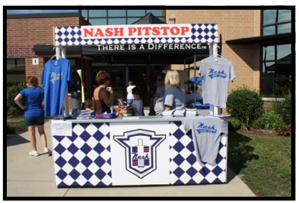
"Pitstop"?? No Met parts here. Just school stuff. Inside was ice cream and pizza.