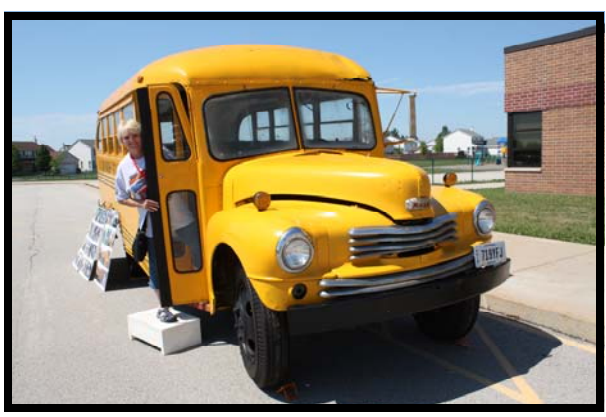
This "Nash" school bus added a bit of whimsy to the school's Open House & Ice Cream Social.