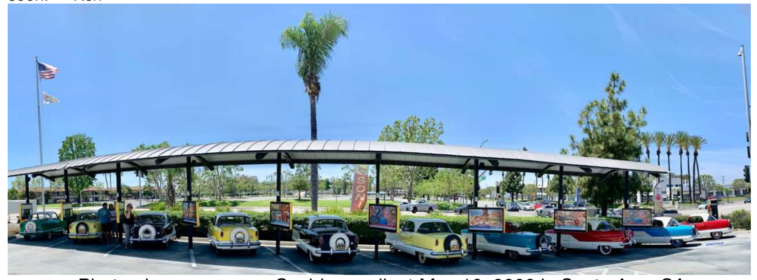
Photo above, we were Covid compliant May 16, 2020 in Santa Ana, CA Below, camera looking into the sun Jan 25, 2020 at Long Beach, CA