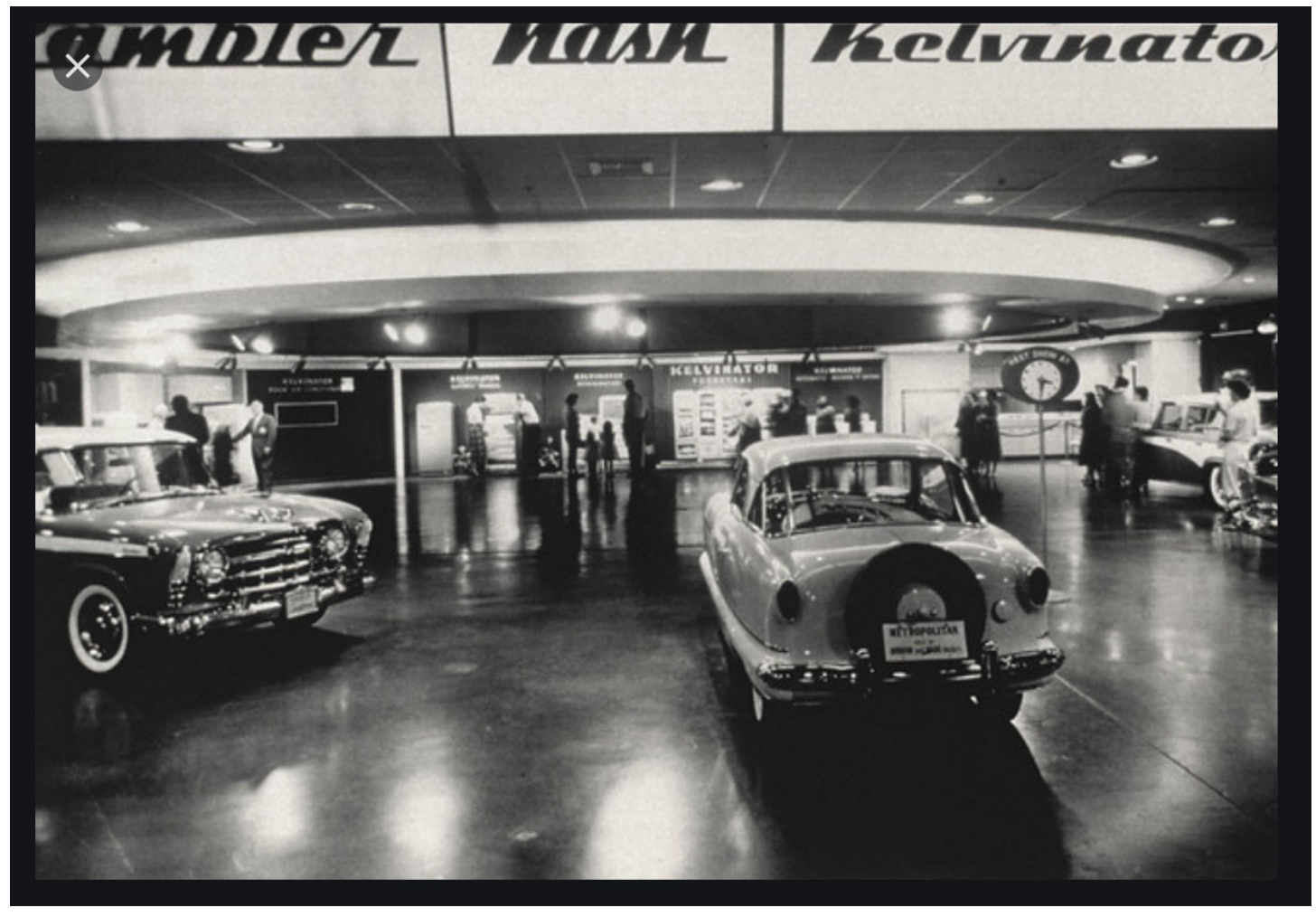
Then in 1959 it was upgraded to show "America The Beautiful" and sponsored by Bell Telephone.