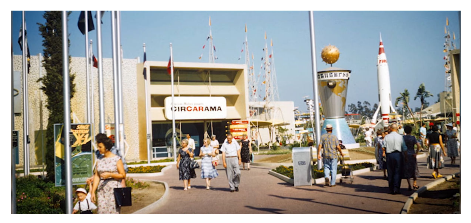
Did you know Disneyland's first Circarama Theater, 1955, was sponsored by American Motors?