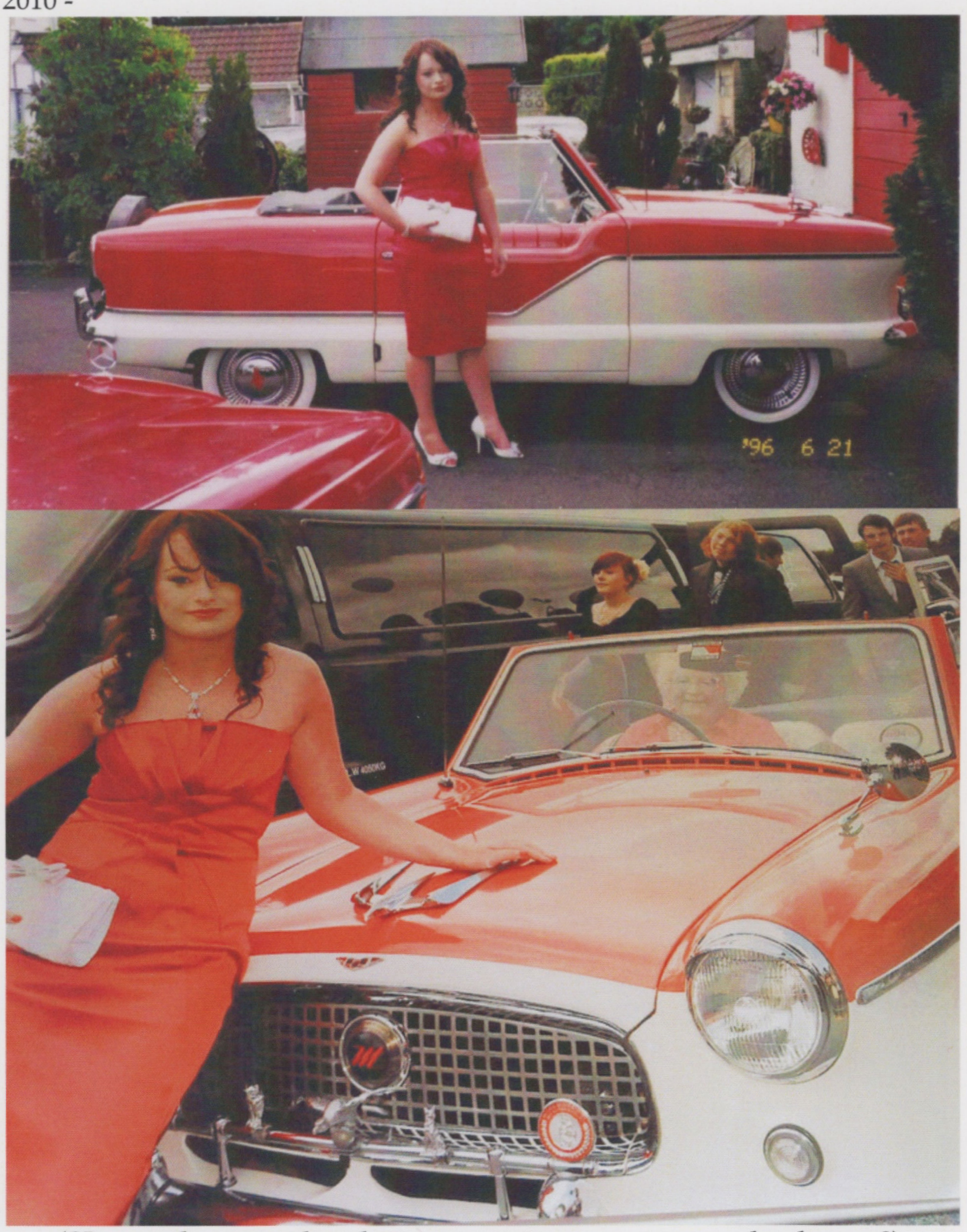
(SJ - can there ever be a better way to turn up at your school prom?)