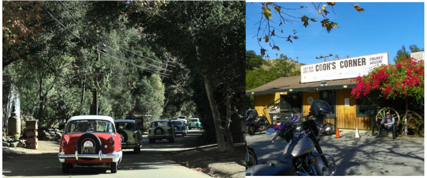
See: https://www.youtube.com/watch?v=EivBfRzT338 for a You Tube video of a canyon run.