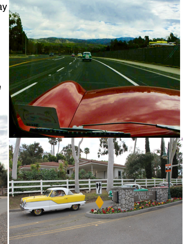
And yes, we came across horse people out for a Saturday ride.