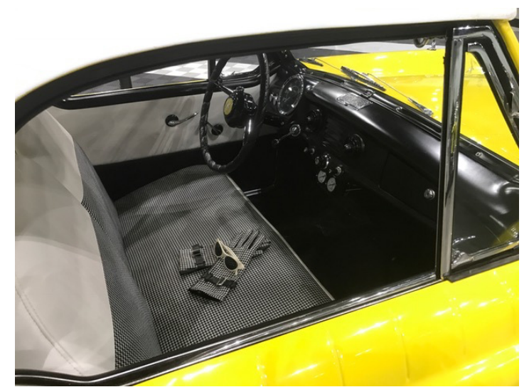
Note Cindy's houndstooth driving gloves & matching white frame shades.