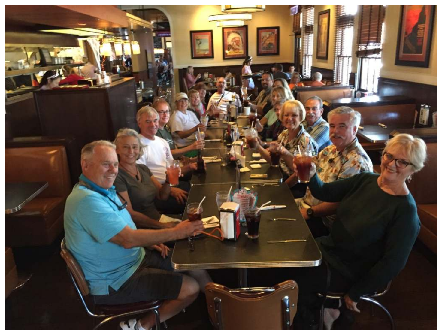
We cruised around the Orange traffic circle TWICE & doubled back to Ruby's Train Station for a cordial lunch.