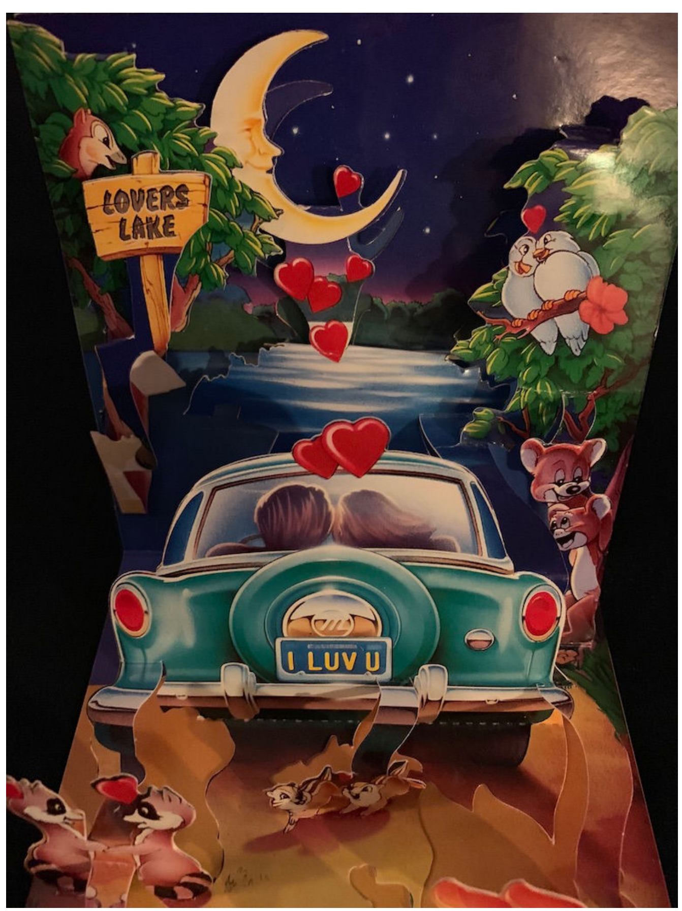
Amongst our plethora of Metropolitan memorabilia we found this old pop up card just in time for February 14th.