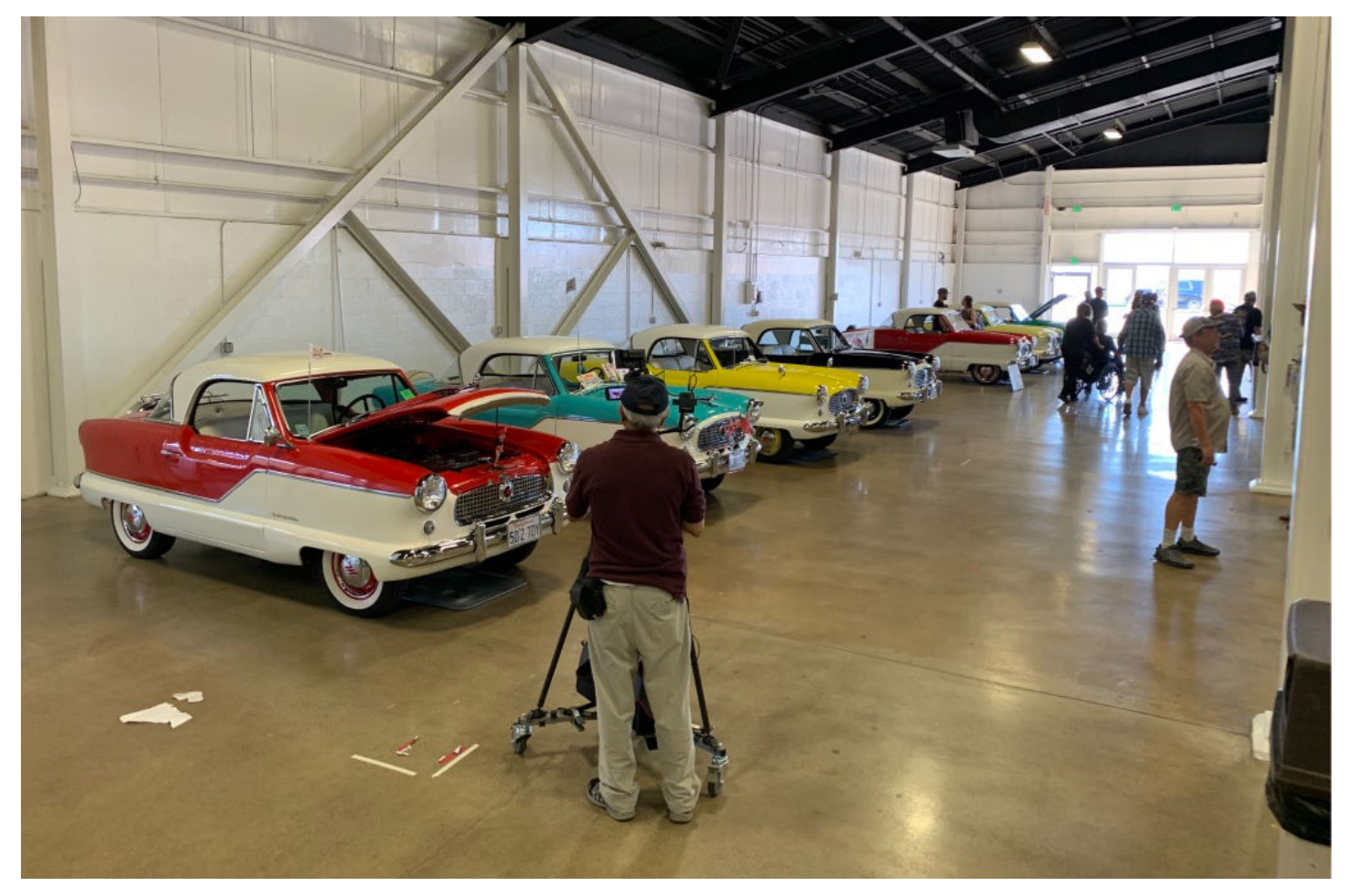
For a video walk around of our cars by Dan O Vision go to: https://www.youtube.com/watch?v=bvV7Jt_YXLc&feature=youtu.be