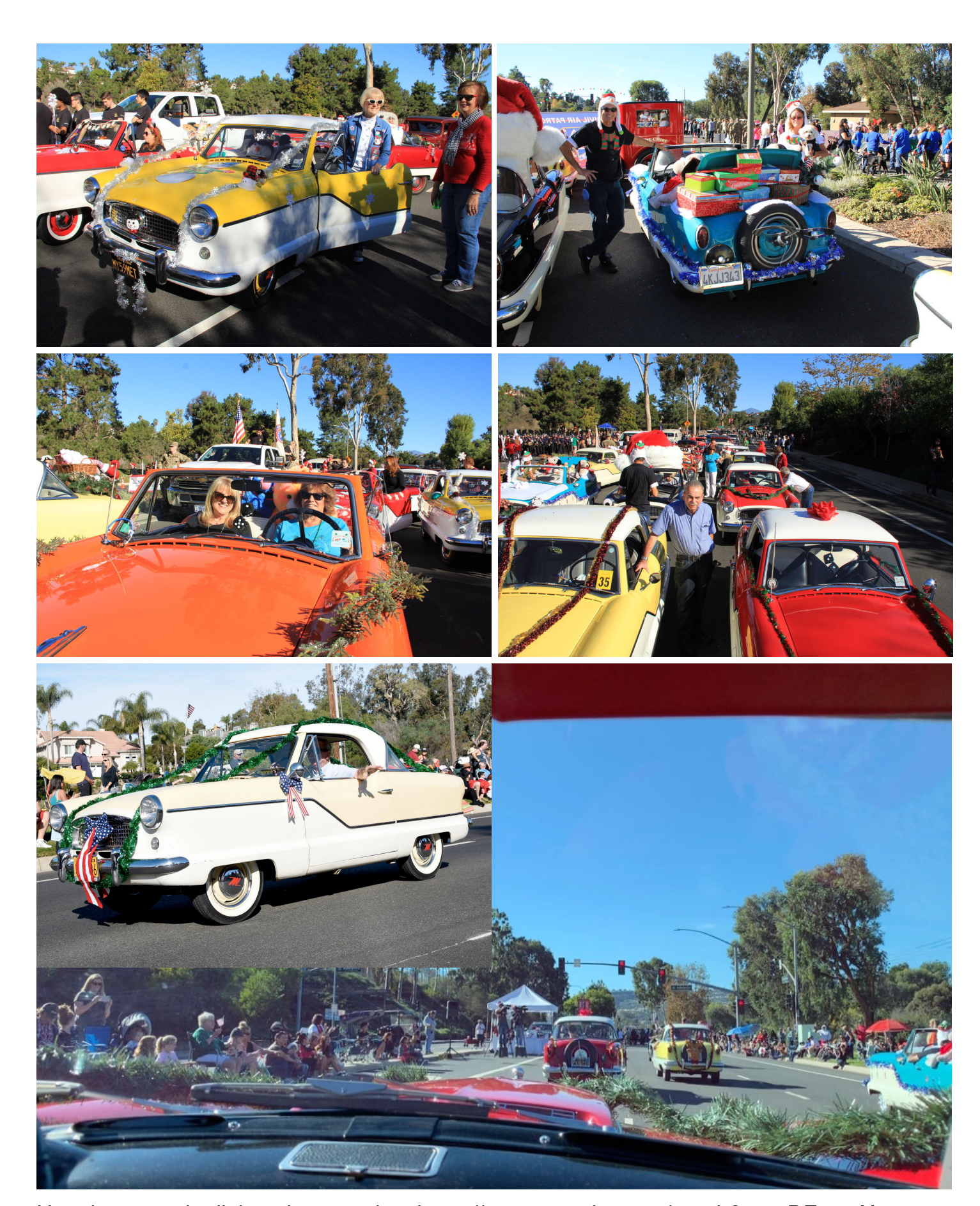
Here is a youtube link to the parade: https://www.youtube.com/watch?v=vyDFa1tnX7s. We are seen at the 20.30 minute mark.