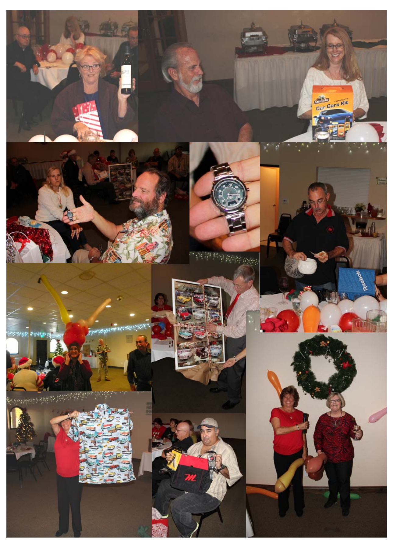
Additional photos & videos are on our web site under "events"